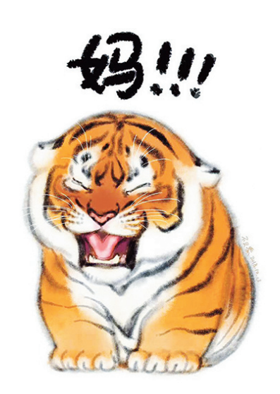
"Cub Calling for Its Mother" is one of Bu2ma's most popular works.

"I tried to draw other things after Panghu gained fame, but none of them gained such